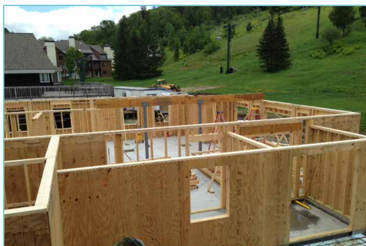
Construction - Andrea Mead Lawrence Lodge at Pico Mountain