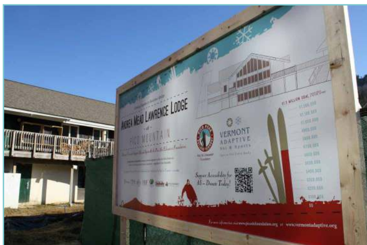
Andrea Mead Lawrence Lodge at Pico Mountain