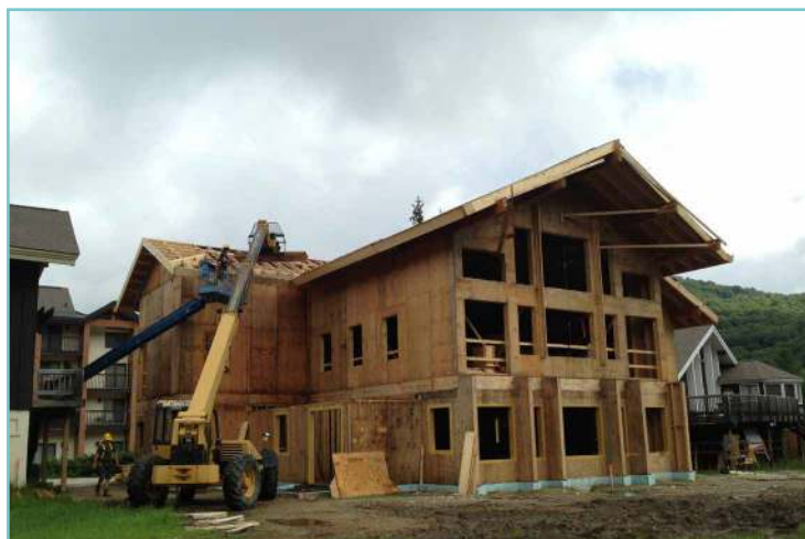
Construction - Andrea Mead Lawrence Lodge at Pico Mountain