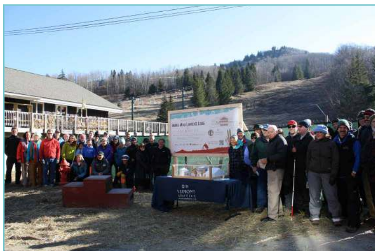
Andrea Mead Lawrence Lodge at Pico Mountain